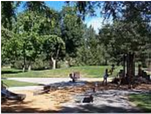
Ann Morrison Park Playground Area