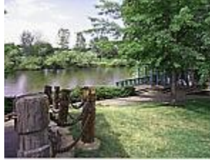
Boise Greenbelt Shoreline Park Area 13th Street