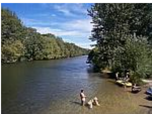
Boise River Scene Ann Morrison Park

The latest version of the Boise ID Screen Saver can always be found on the Enterprise Technology website: http://www.enterprise-technology.net