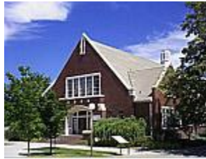
Western Studies Building Boise State University