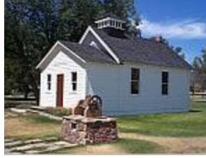
Opaline One Room School now on campus Boise State University