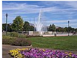
Fountain Ann Morrison Park