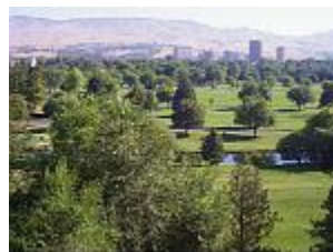
View North toward down- town across Ann Morrison Park from Crescent Hill Rd