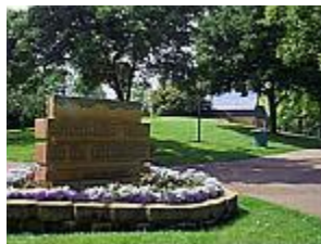
Boise Greenbelt Shoreline Park Area 13th Street