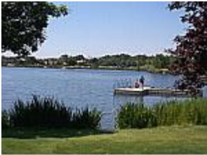
ParkCenter Pond ParkCenter Boulevard