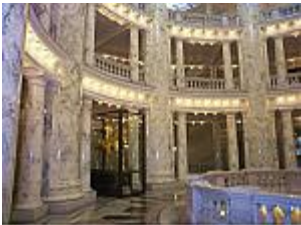
Idaho State Capitol ca 1920 Interior View