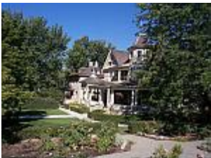
Staff Housing Old Idaho State Penitentiary (now museum)