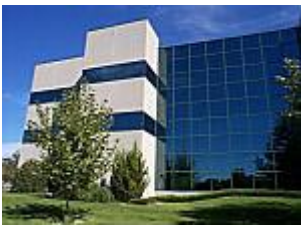
Office Building Boise Greenbelt Area River Street