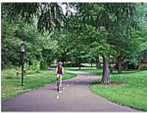
Boise Greenbelt Shoreline Park Area 13th Street