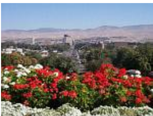
View North along Capitol Boulevard from RR Depot