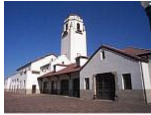
Boise RR Depot (trackside)