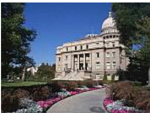
Idaho State Capitol ca 1920