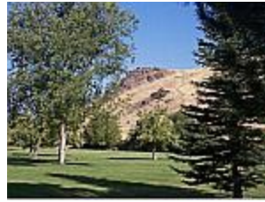
Foothills view, SE Boise