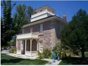
Bown House ca 1865 Riverside School Campus