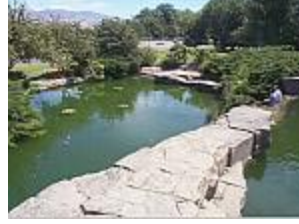
Pond Boise RR Depot