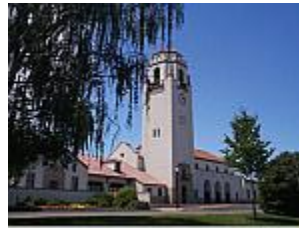
Boise RR Depot (front)