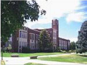
Administration Building ca 1940 Boise State University