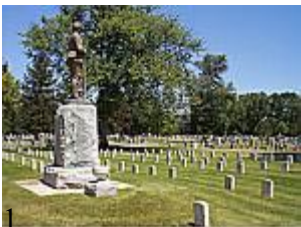
Civil-War-era section Rose Hill Cemetery Americana Boulevard