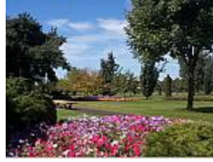
Ann Morrison Park