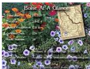
Boise At A Glance Demographics Page