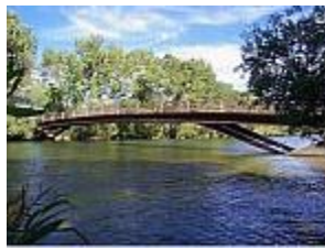
Boise River Scene Ann Morrison Park footbridge to Greenbelt