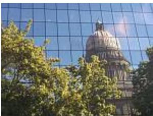
Reflection of Capitol Hall of Mirrors State Office Building

The latest version of the Boise ID Screen Saver can always be found on the Enterprise Technology website: http://www.enterprise-technology.net