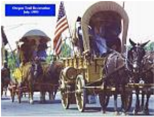
July 1993 Oregon Trail Celebration Capitol Boulevard