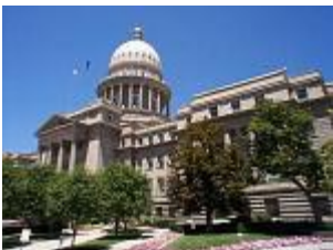
Idaho State Capitol ca 1920