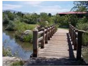
Kathryn Albertson Park