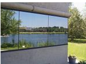
Reflection of ParkCenter Pond in Office Building on pond grounds